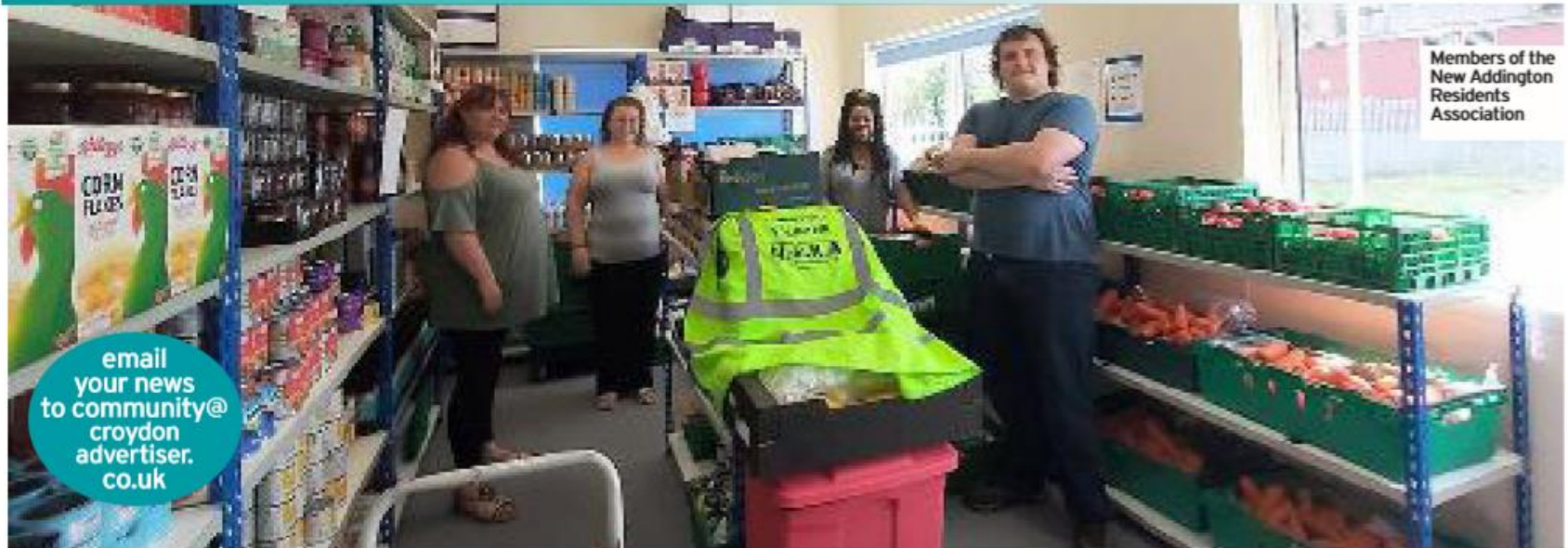
Members of the New Addington Residents Association

email your news to community@crodonadvertiser.co.uk